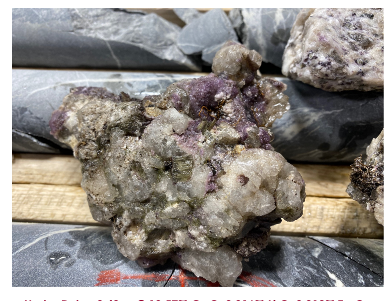
Hydra Dyke: 0.40 m @ 13.57% Cs<sub>2</sub>O, 0.316% Li<sub>2</sub>O, 0.012% Ta<sub>2</sub>O<sub>5</sub> and 0.38% Rb<sub>2</sub>O