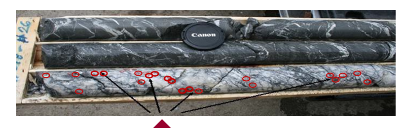
Mineralized Quartz Vein: Red circles indicate visible gold